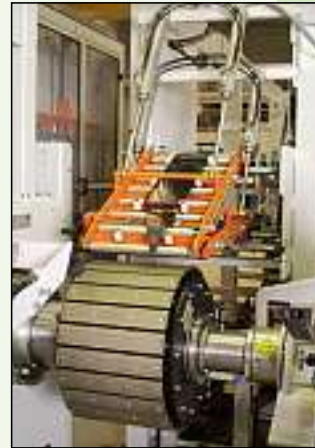
Manual breaker applicator