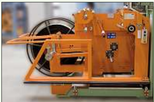
Dual shuttle reel tread let-off (option)