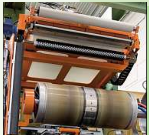
Automatic carcass applicator