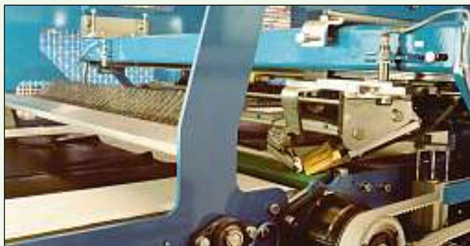
Ultrasonic knife assembly