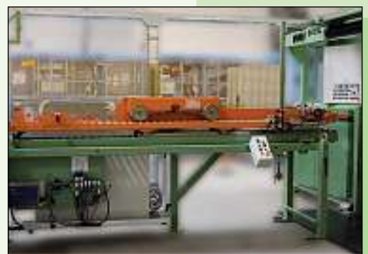
Pre-cut tread applicator